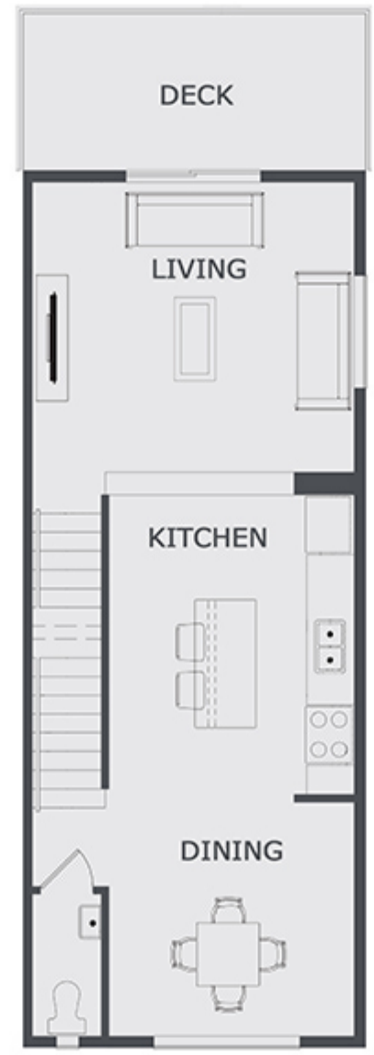
MAIN FLOOR PLAN 588 S.F.